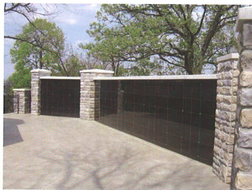
Columbarium niche spaces now help distinguish the plaza from its surroundings.