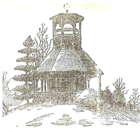
The original "Lookout Tower" sketch from "The Dayton Daily News" March 12, 1899.

The Tribute Companies, a cemetery design, development and administration company, is based in Hartland, WI and may be reached by email at mail@tributeinc.com .