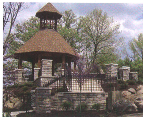
Recently dedicated "Lookout Tower" replica, including the columbarium shown at left.